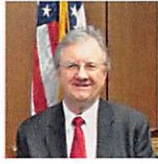
Mayor Robert Sabosik