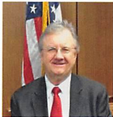
Mayor Robert Sabosik