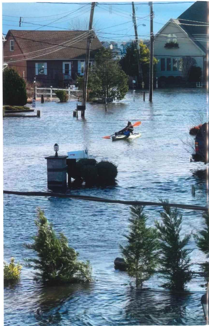
Brick Township Flooding.

The mayors of this group decided that a realistic and regional approach could help in the long term and formed the consortium with Point Pleasant Borough the lead agency of the group. Each participating town put in starting funds that have gone towards an attorney and engineer to start putting the wheels in motion and to go after grant money for research and subsequent construction."